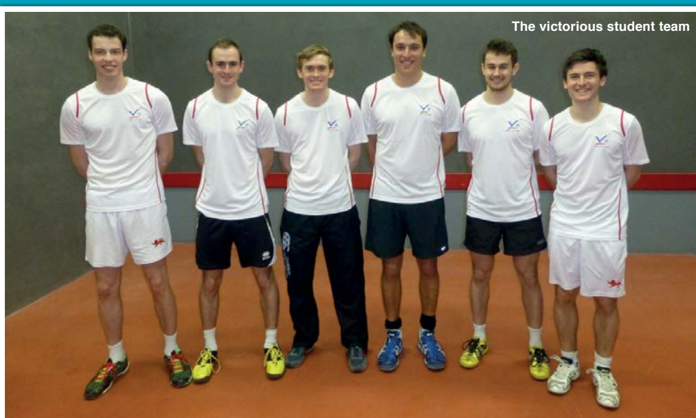
The victorious student team