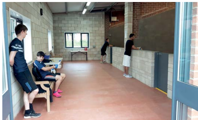
The newly enclosed Derby Moor courts