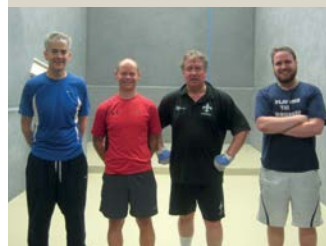
ABOVE The Cambridge Chroniclers on their home courts