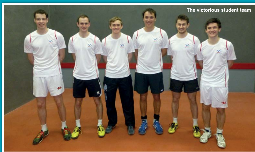
The victorious student team