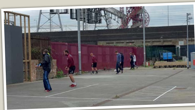
Wallball, just a stone's throw from the Olympic Stadium

West Ham United Foundation aims to break down barriers to sports access both for football and for other sports. FRE Flyers is a group of young hockey players who want to help the community.