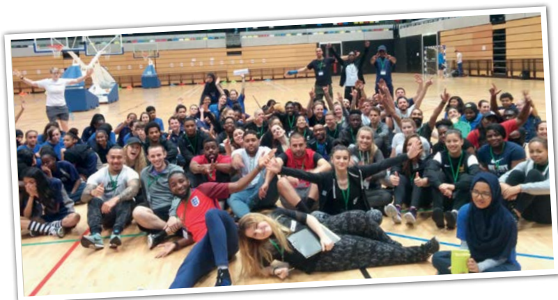
LEFT Youngsters at the Newham SportInspired games